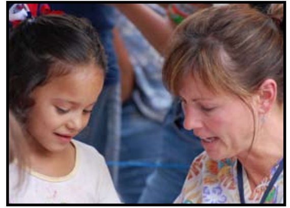
The Honduras team returned home with stories about the privilege of sharing the gospel in a foreign country.