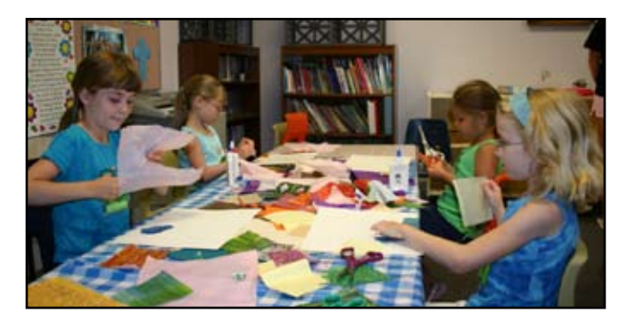
A dabble here and a dabble there was a common sight at this week's fine arts camp. The artists crafted several masterpieces using different mediums. The week ended with an art show where families and friends were invited to view their works of art.